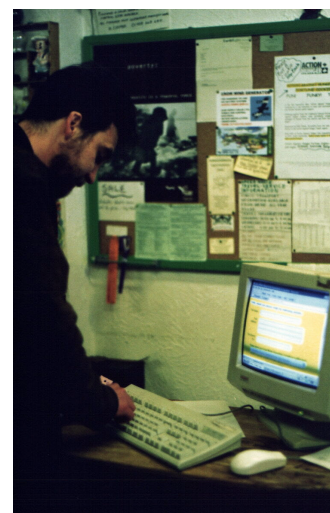
A member of the public uses the system in The Greenhouse

The staff of The Greenhouse now have sessions when the shop is open where members of the public can drop in and composite their letter of objection in a few minutes. These letters can then be collected together and posted in bulk, or sent by the individual themselves if they prefer.