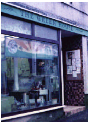
The Greenhouse, Llandeilo

Dinefwr Green Group (DGG) has, for a number of months, campaigned against a number of superstore proposals in their part of Carmarthenshire, West Wales. Over the past year there has been a rush of applications for new superstores as the cut-price chains seek to compete with the larger supermarket chains. DGG have been campaigning on many of these applications with other groups in the area. DGG itself is associated with a group that runs a fundraising and recycling shop in Llandeilo – The Greenhouse (pictured below) – and this has provided a focus for organising local campaigns.